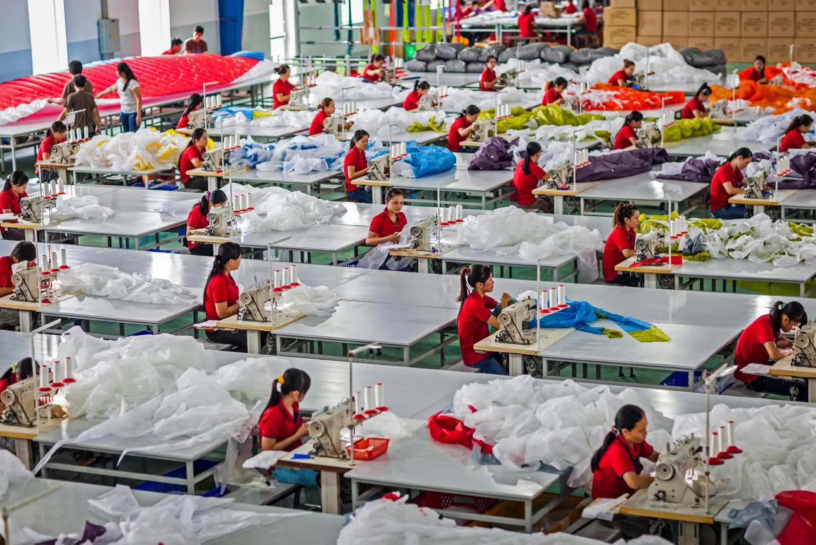
The factory built for Advance's sole use has impressive dimensions: 220 employees are involved in production. Advance has been responsible for its own production for twenty five years now.