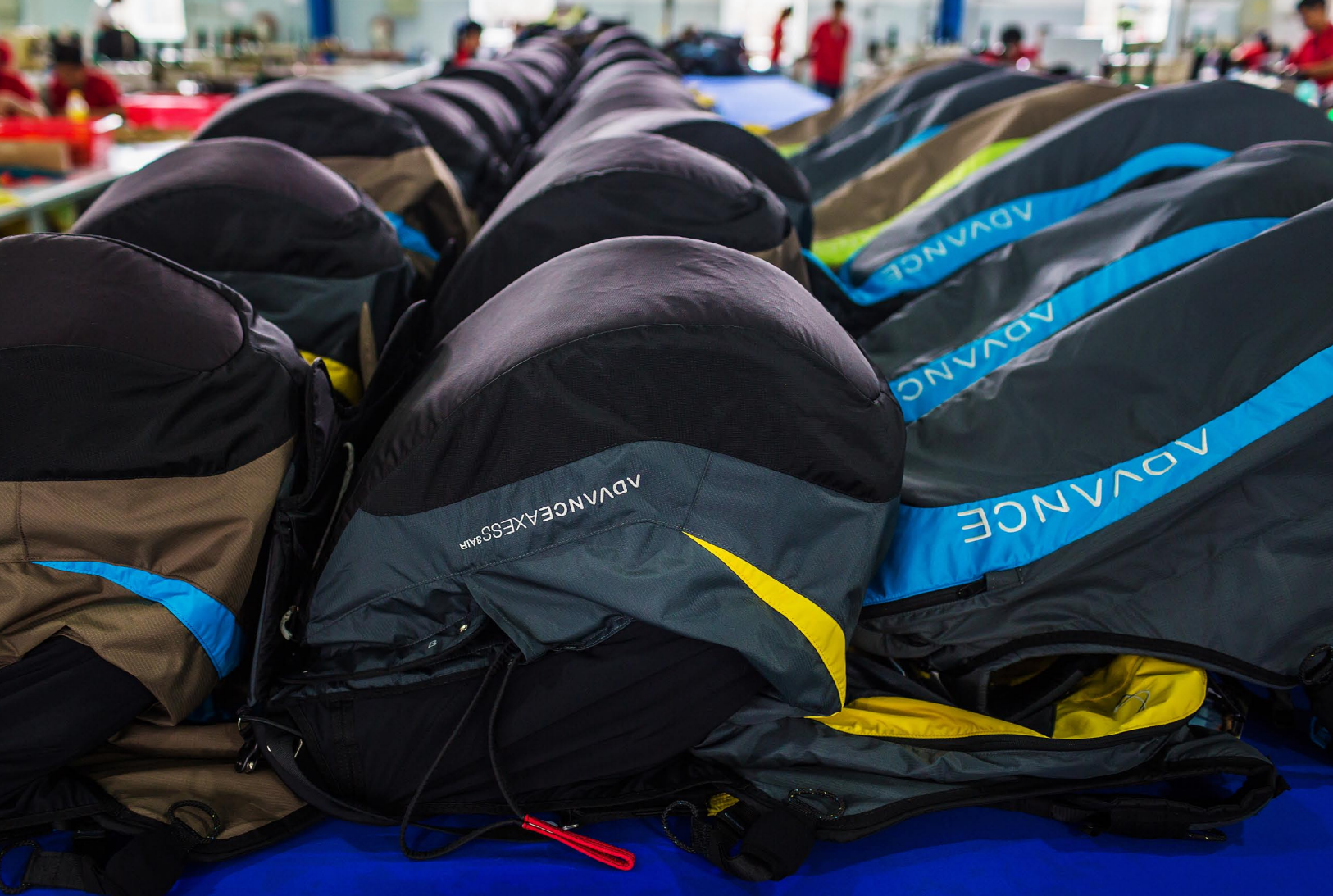
Harnesses make up an important part of Advance's range; they are also made here at the new site in Hồ Chí Minh City...